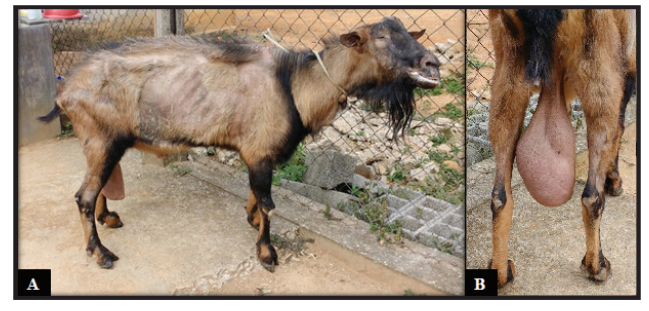
Figure 1. A- Male Alpine goat (12-year-old) presenting chronic cachexia. B- Asymmetric scrotum with enlarged left and contralateral right testicles.

Due to the poor prognosis and regard for animal welfare, the goat was euthanized according to the